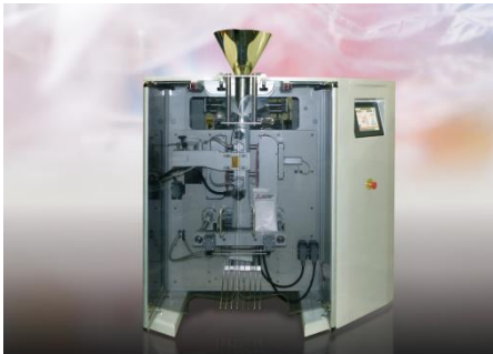
Figure 2: Tubular bag machine: The system uses predefined function blocks especially for packaging machines which can be used to set up control systems including HMIs quickly and easily.