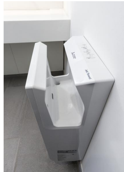
Jet Towel hand dryers