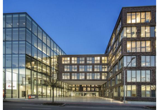
German branch of Mitsubishi Electric